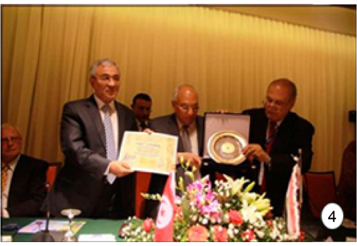
1 Cesky Krumlov - 2 "Walk of Peace" (Slovenia) - 3 Hamamönü(Turkey) - 4 Alexandria (Egypt)